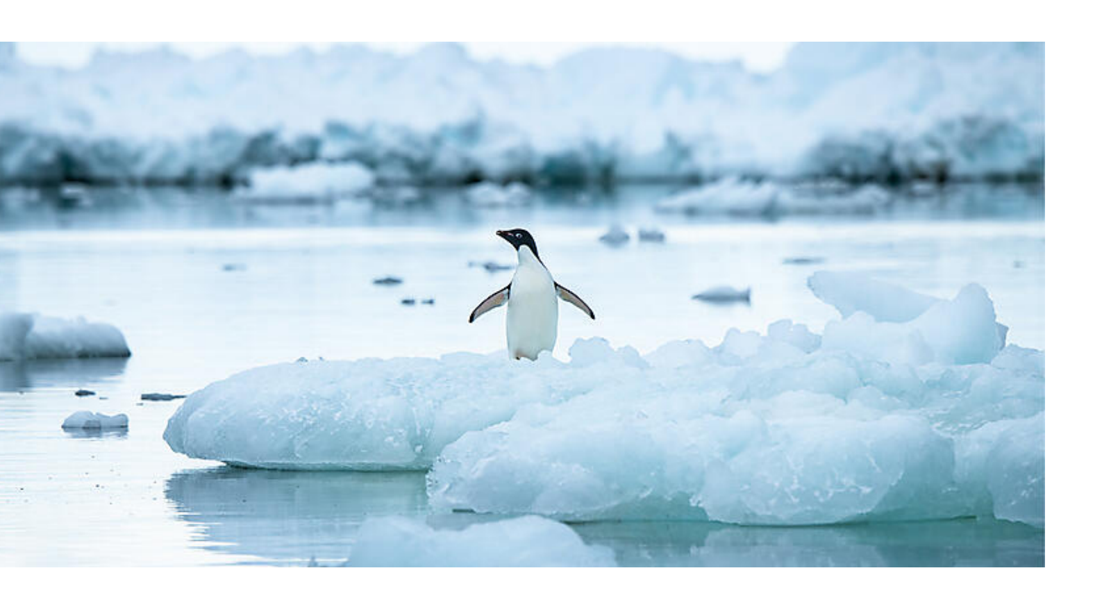
The information in this document is valid as of 24/04/2024